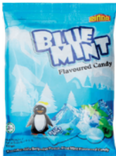
Q. Blue Mint Flavoured Candy