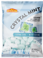
Crystal Mint Flavoured Candy