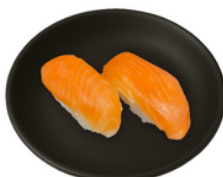
Frozen Sushi Salmon Halal