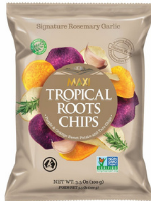
MAXI Tropical Roots Signature Rosemary Garlic Flavor