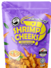
Oyu TomYum Shrimp Cheeks 30g