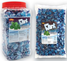
Blue Mint Flavoured Candy