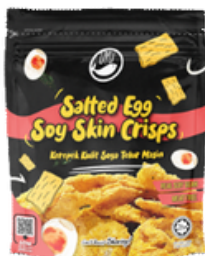
Oyu Salted Egg Soy Skin Crisps 70g