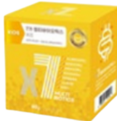
X7 Multibiotics Kids