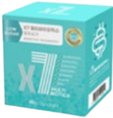
X7 Multibiotics Low Sugar

Shinsung Bio Pharm is engaged in the high value-added business of manufacturing collagen from discarded fish skin. As a company that cares about the environment, we are producing safer fish collagen, because of the concern that collagen from meat can pose risks to humans, such as mad cow disease, in the course of handling discarded by-products.