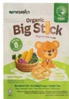
Natufoodies Organic Big Stick Garden Veggies 20g