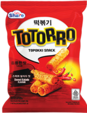
Totorro Snack Sweet Balado Flavor

Let's Share, DagangHalal's innovative in-house brand, specializes in Korean & Japanese fusion snacks that uniquely blend traditional Korean flavors with local influences. This exciting product line features goods like Sweet Balado-flavored snacks, which combine the rich, spicy essence of Indonesian cuisine with popular Korean snack formats.