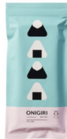
ONIGIRI Roasted Seaweed (24 sheets of 3 slices)