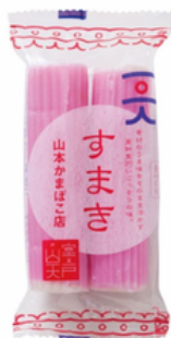
Sweetened Fish Cake with Trace of a Duckboard - 92g