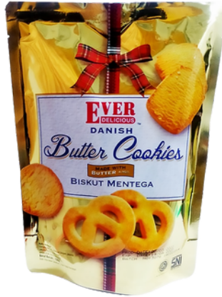
Everdelicious Danish Butter Cookies