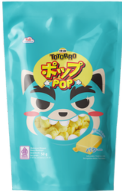
Totoro Pop - Butter Flavor (pouch)