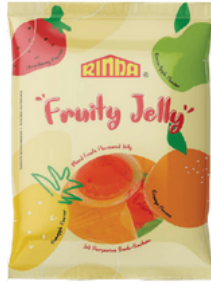
Rinda Mixed Fruits Flavoured Jelly