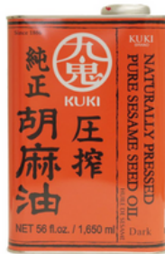
KUKI Pure Sesame Seed Oil-1516g