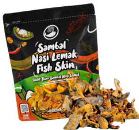
Oyu Sambal Nasi Lemak Fish Skin 70g