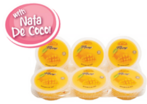
Rinda Mango Flavoured Pudding with Nata De Coco