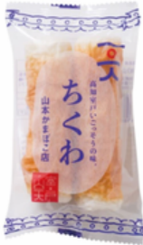
Bamboo Tube Shape Fish Cakes - 94g (2 pcs)

Our production facility operates under strict quality standards and is certified halal by NAHA (Nippon Asia Halal Association), ensuring compliance with international halal requirements and rigorous food safety practices. With a proven legacy of excellence, Yamamoto Kamaboko Ltd. continues to expand its reach to discerning markets worldwide, catering to importers, wholesalers, and OEM partners seeking trusted Japanese halal products.