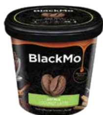
BlackMo Oat Milk Coconut Latte 340g

Renowned for its commitment to quality and innovation in the food industry, BlackMo offers a multi range of molasses and oat milk beverages, as well as instant premixes with the use of premium ingredients to create products that cater to modern tastes while maintaining traditional flavors.