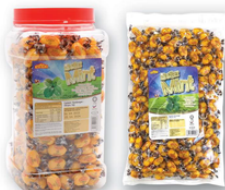
Butter Mint Flavoured Candy