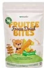
Natufoodies Freeze Dried Fruitee Bites - Mango Banana Papaya 15G