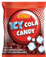
ICY Cola Flavoured Candy