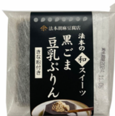
Black Sesame Soy Milk Pudding Halal Vegan- 80g