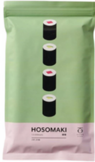
HOSOMAKI Roasted Seaweed (20 sheets of 2 slices)