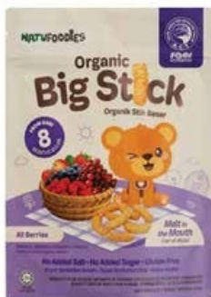
Natufoodies Organic Big Stick - All Berries 20g