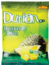
Durian Flavoured Toffee