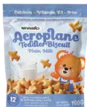
Natufoods Aeroplane Toddler Biscuit - Plain Milk 100g