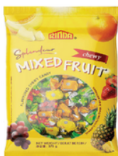
(Splendeur Chewy) Mixed Fruit Flavoured Candy