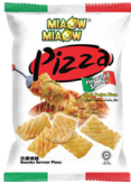
Miaow Miaow Pizza Flavoured Snacks