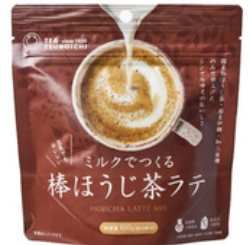
Hojicha latte mix-100g