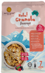
Hola! Granola Beverage - Yoghurt Mixberries