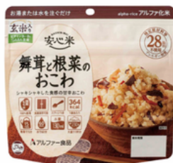
Anshinmai Steamed Rice with Maitake mushrooms and Root Vegetables (with Brown Rice)-100g

Bell International Inc. (Tokyo; Corp. No. 4040001032563), established in 2002, (Tokyo; Corp. No. 4040001032563) is a Japan-based general trading company founded in 2002, specializing in the import and export of food products including health foods/supplements, tea, and gluten-free confectionery from trusted Japanese and international brands such as ORIHIRO, Unimat Riken, Tsuboichi, and Rucola