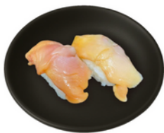
Frozen Sushi Ark Shell Halal