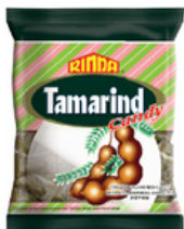
Q. Tamarind Flavoured Candy