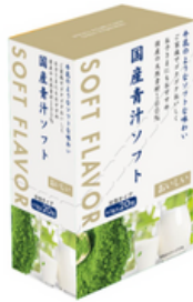
Japanese green juice lactic acid bacteria (boxed)-90g