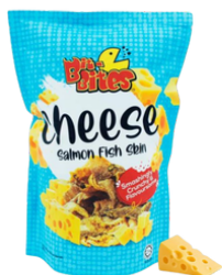
SALMON FISH SKIN_Cheese