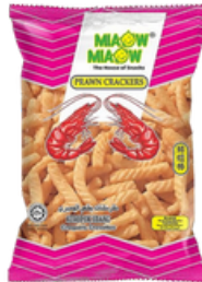
Miaow Miaow Prawn Crackers