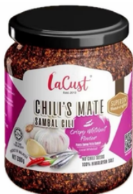
CHILI'S MATE WHITEBAIT FLOUR