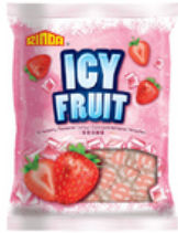
ICY FRUIT Strawberry Flavoured Candy