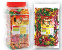
Assorted Fruit Flavoured Candy