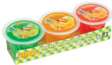
Rinda Mixed Fruits Flavoured Jelly