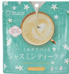
Jasmine Tea Latte Mix-80g