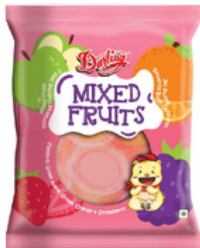
Darling Mixed Fruits Flavoured Pudding