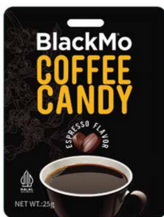
BlackMo Coffee Candy (Espresso)