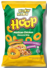
Miaow Miaow Hoop Mexican Chicken Ring