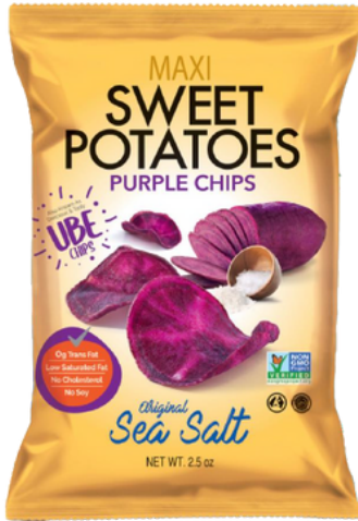
MAXI purple sweet potato chips