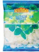
White Mint Flavoured Candy