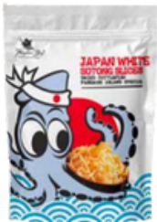
Pangkor Boy Japan White Sotong Slice 50g