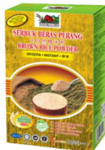
Brown Rice Powder