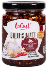
CHILI'S MATE ORIGINAL GARLIC FLAVOR

Lacust Food Manufacturing Sdn Bhd is a Malaysian producer of premium chili condiments. Our flagship Chili's Mate and Crispy Garlic series have expanded to 800+ retail outlets in Malaysia, trusted for their authentic taste and consistent quality. With strong certifications, modern production standards, and OEM capabilities, Lacust Food is ready to bring Malaysia's bold flavors to the European market.