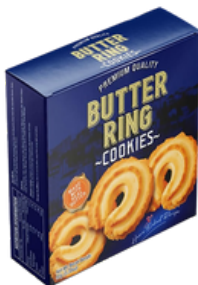
Everdelicious Butter Ring Cookies