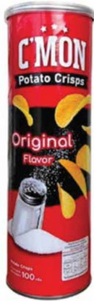
C'mon Potato Crisps Original