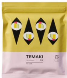
TEMAKI Roasted Seaweed (20 sheets of 4 slices)

Based in Kuwana City, Momofuku Co., Ltd. is a specialist in Japanese seaweed products and the company behind the Norimomo brand. With a mission "Passing on Nori to the Next 100 Years," the company is dedicated to preserving Japan's nori culture while making it relevant for global markets. Norimomo offers a curated range of seaweed selected directly from trusted auctions, structured into three key lines – Premium, Everyday, and Innovative – designed for gourmet retail, household consumption, and creative foodservice applications.