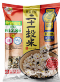
21 MULTI GRAINS -180g

Tanesho Co., Ltd., founded in 1946 in Tosu City, Saga Prefecture, is a pioneer in Japan's grain and health food industry. With more than 75 years of expertise, the company has grown into the nation's largest supplier of grain-based products, offering the widest range in Japan—from traditional staples like rice, barley, and millet to innovative blends tailored to modern health-conscious consumers.