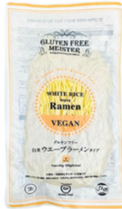
KUKI BLACK SESAME LATEE MIX(UNSWEETENED)-300g

Kobayashi Seimen Co., Ltd. traces its roots back to 1947, when it began crafting fresh noodles in Gifu City, Gifu Prefecture. Over nearly eight decades, the company has grown from humble beginnings to become a trusted regional producer of a wide range of fresh noodles—such as udon, soba, ramen, and pasta—while also offering innovative options like gluten-free rice-flour noodles and custom OEM products.