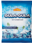
Blue Mint Flavoured Candy