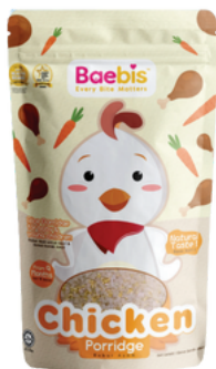
Chicken & Vegetable Porridge