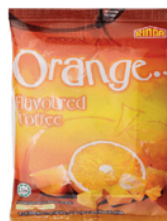
Orange Flavoured Toffee