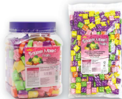
Splendeur Mixed Fruits Flavoured Candy (Vegan)