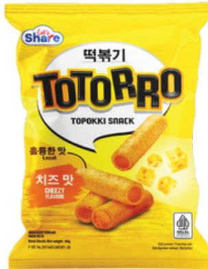
Totorro Snack Cheesy Flavor