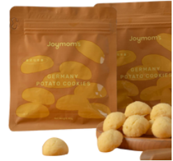
Germany potato cookies