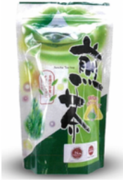
Green Tea- 20bags