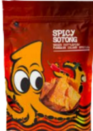
Pangkor Boy Spicy Sotong 50g