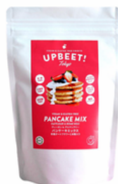
Plant-based & gluten-free Pancake Mix-260g