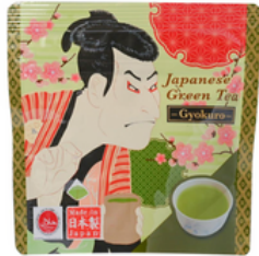
Highest Green Tea 10bags Japanese Ukiyoe Design-10 bags