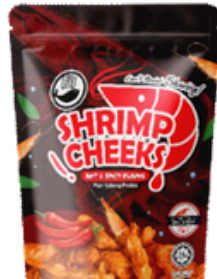
Oyu Hot & Spicy Shrimp Cheeks 30g