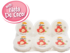
Rinda Lychee Flavoured Pudding with Nata De Coco