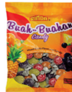
Mixed Fruits Flavoured Candy