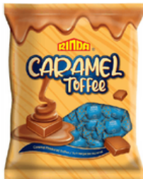
Caramel Flavoured Toffee