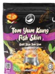
Oyu TomYum Kung Fish Skin 70g