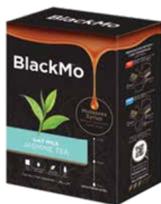
BlackMo Oat Milk Jasmine Tea 170g

Product Categories Halal Beverages HS Code 2101209000