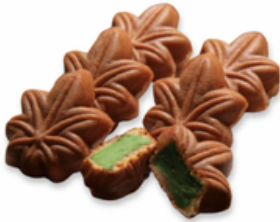
Momiji Manju (Macha Flavor)

A seafood manufacturer located in kuwana city, mie prefecture. Since its establishment in 1962, we have been striving to pursue the taste of the real and the taste of nature in order to contribute to the eating habits of households all over Japan through "seafood" such as seaweed, kelp, shrimp, etc. which are representative of seafood of the sea.