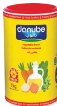
Vegetables Powder 1kg