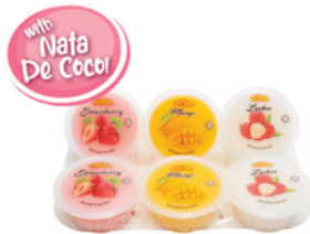
Rinda Mixed Fruits Flavoured Pudding with Nata De Coco