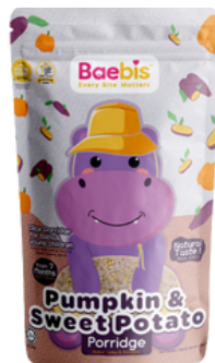
Pumpkin & Sweet Potato Porridge