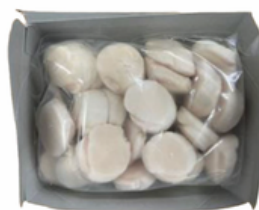
Muscles of Scallops 4S- 1kg(20pcs)