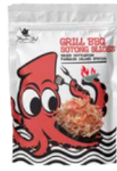
Pangkor Boy BBQ Grill Sotong Slice 50g