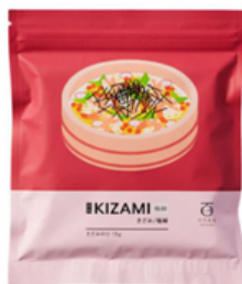
KIZAMI roasted seaweed