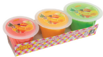
Rinda Mixed Fruits Flavoured Pudding