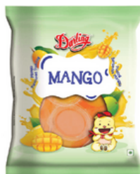
Darling Mango Flavoured Pudding