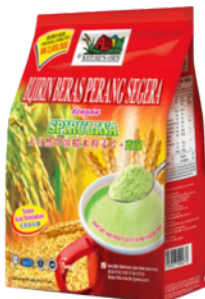
BROWN RICE CEREAL WITH SPIRULINA (No add sugar)