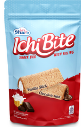
IchiBite Snack Bar With Chocolate Filling (pouch)