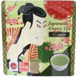
Gyokuro Tea TB(Green tea)-25g