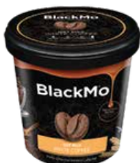
BlackMo Oat Milk White Coffee 340g