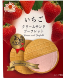
Gaufrette Strawberry -80g