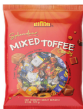
Splendeur Mixed Toffee