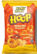
Miaow Miaow Hoop Cheesy BBQ Ring