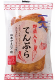
Tempura With Vegetable - 130g (2 pcs)