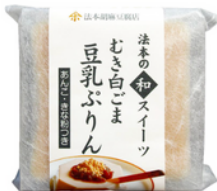
Soy milk Sesame pudding