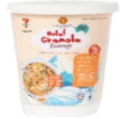
Hola! Granola Beverage Cup - Yoghurt Mixberries