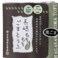
NAGASAKI Chewy Sesame tofu Black sesame