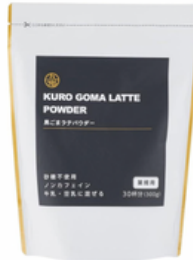
KUKI BLACK SESAME LATEE MIX(UNSWEETENED)-300g