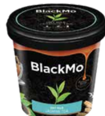
BlackMo Oat Milk Jasmine Tea 340g