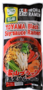
Toyama Black Soy-sauce Vegan Ramen-180g(2 servings)

RESSY INTERNATIONAL has discovered many high-quality Japanese products and actively proposes them to overseas customers. Through new businesses, we will contribute to increasing the appeal of the Japan brand overseas while taking pride in our culture, history, and ideology. Our philosophy is to pass on Japan's nature, culture, and traditions to the future.