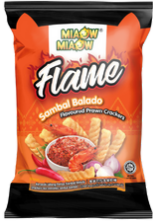
Miaow Miaow Flame Series Sambal Balado Prawn Cracker