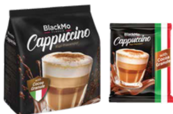
Blackmo Classic Premix Cappuccino With Cocoa Granule 459g