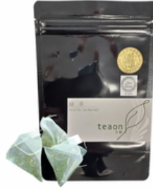
Green Tea Tea Bag -54g