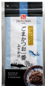
Katsuo (Bonito) Furikake