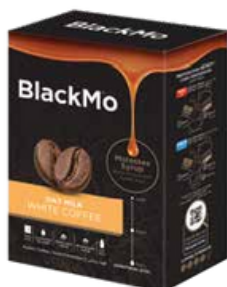
BlackMo Oat Milk White Coffee 170g