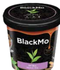
BlackMo Oat Milk Maple Tea 340g