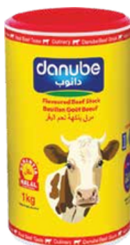
Beef Boullion Powder 1kg