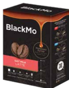
BlackMo Oat Milk Latte 170g