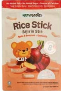
Natufoodies Rice Stick - Apple Beetroot 35g