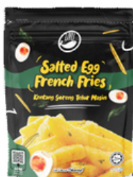
Oyu Salted Egg French Fries 70g