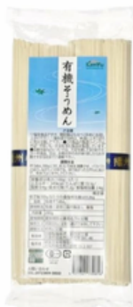
Organic Somen Noodles-280g

Founded in 2002 in Hirakata, Osaka, KenYu Trading Co., Ltd. specializes in the trade of organic and natural food products. Established by industry veterans with over 20 years of experience, the company is dedicated to promoting health and environmental sustainability by supplying high-quality, safe, and affordable food ingredients to international buyers.