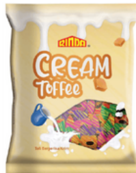
Cream Flavoured Toffee