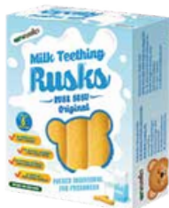
Natufoodies Milk Teething Rusks - Original 90G