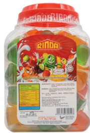
Darling Mixed Fruits Flavoured Jelly