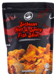
Oyu Sichuan Hot & Spicy Fish Skin 70g

OyuFish is a Malaysian snack brand that caters to local customers. Since 2017, we have been making “Salted Egg Fish Skin Snacks” and are well known for them. More than 256,000 Packs of our snacks were sold in Malaysia in 2019 and our snacks are available in mostly supermarkets.