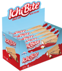
IchiBite Snack Bar With Chocolate Filling (Box)