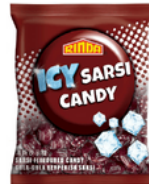
ICY Sarsi Flavoured Candy