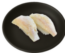
Frozen Sushi Scallop Halal