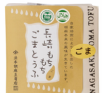
NAGASAKI Chewy Sesame tofu Sesame