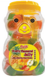
Darling Fruity Flavoured Jelly