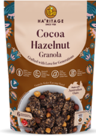
Cocoa Hazelnut Granola