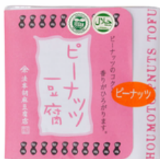
Peanut Tofu Kinako powder and muscovado syrup included HALAL-100g

For everyone's health, beauty, and comfortable living environment, we cherish every encounter to share the new possibilities.