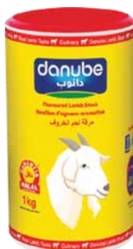
Lamb Boullion Powder 1kg