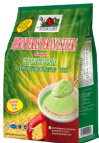
BROWN RICE CEREAL WITH SPIRULINA (Less sugar)