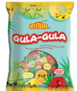
Q. Mixed Fruits Flavoured Candy