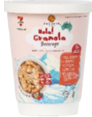
Hola! Granola Beverage Cup - Honey Almond