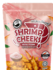
Oyu Sea Salt Shrimp Cheeks 30g