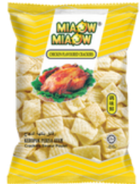
Miaow Miaow Chicken Flavoured Crackers