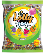
Lollyjoy Fruity Sour Flavoured Lollipop