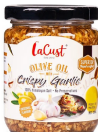
CHILI'S MATE CRISPY GARLIC WITH OLIVE OIL - ORIGINAL