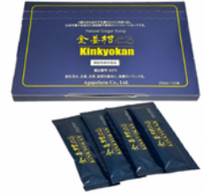
Ginger Syrup Kinkyokan-20ml