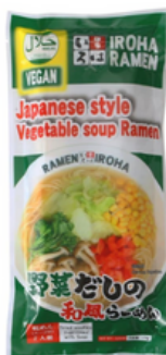
Japanese Style Vegetable soup Vegan Ramen-176g(2 servings)