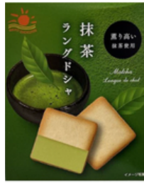
Langue de Chat (Match)