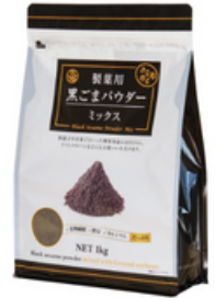
KUKI BLACK SESAME POWDER MIX FOR CONFECTIONERY & BAKING-1kg