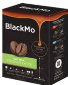
BlackMo Oat Milk Coconut Latte 170g