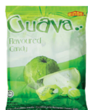
Q. Guava Flavoured Candy