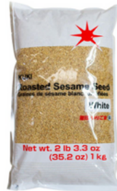
KUKI Roasted Sesame Seed White / Black-1kg