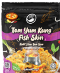
Oyu TomYum Kung Fish Skin 30g

OyuFish is a Malaysian snack brand that caters to local customers. Since 2017, we have been making "Salted Egg Fish Skin Snacks" and are well known for them. More than 256,000 Packs of our snacks were sold in Malaysia in 2019 and our snacks are available in mostly supermarkets.