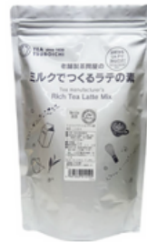
R3 Hojicha Latte mix-1kg