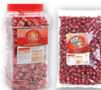
ICY Cola Flavoured Candy