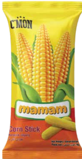
C'Mon Mamam Corn Stick 9g x 24 packs