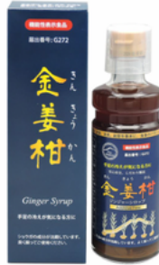
Ginger Syrup Kinkyokan -300ml

Founded in October 2013 and headquartered in Fukuoka Prefecture, Japan, Agapefarm Co., Ltd. is a sixth-industry food-tech company dedicated to cultivating safe, pesticide-free vegetables and developing additive-free processed foods for health-conscious consumers.