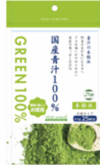
100% Japanese Aojiru -63g