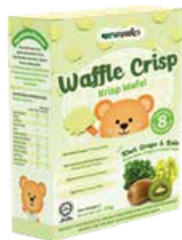
Natufoods Waffle Crisp - Kiwi, Grape & Kale 20g