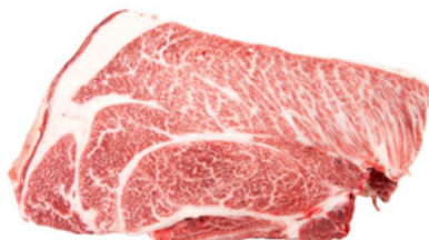
Japanese Kurohana Beef-5kg

Founded in 2021, TKI Trading Co., Ltd. is a premium halal livestock, meat, and poultry supplier from Japan, specializing in authentic Japanese Wagyu beef. Dedicated to delivering only the highest quality protein, TKI combines the heritage of Japanese culinary traditions with strict international export standards to serve discerning global buyers.