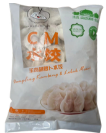
CM Dumpling - Lamb & Carrots - 2kg