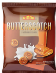
DEP. Butterscotch Flavoured Candy