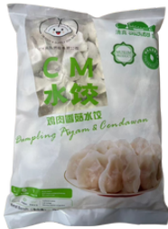
CM Dumpling - Chicken & Mushroom - 2kg