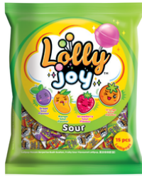
Lollyjoy Fruity Sour Flavoured Lollipop