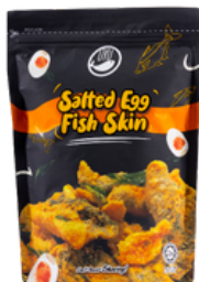
Oyu Salted Egg Fish Skin 70g