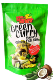
SALMON FISH SKIN-Green curry