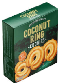
Everdelicious Coconut Ring Cookies

Ever Delicious offers a tempting selection of cookies for every craving. Enjoy the tropical sweetness of Coconut Ring Cookies or the rich, buttery taste of Butter Ring and Danish Butter Cookies. Love fruity flavors? Try our Blueberry or Strawberry Jam Filling Cookies. For chocolate lovers, the Chocolate Cream Filling Cookies are pure bliss. Perfect for sharing or savoring solo—every bite is a delight!