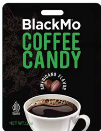
BlackMo Coffee Candy (Americano)

Incorporating caffeine goodness into wholesome snacking, BlackMo accents its production line of coffee-based candies featuring three addictive flavors of Americano, Espresso and Black Tea Latte. Made with authentic coffee goodness, these sweet treats are a must-have pantry staple in every household.