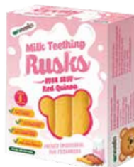
Natufoodies Milk Teething Rusks - Red Quinoa 90G