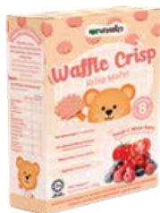
Natufoods Waffle Crisp - Tomato & Mixed Berry 20g