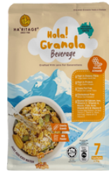
Hola! Granola Beverage - Honey Almond