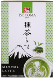
Matcha Latte Box

Founded in 1984, ISOKOMA Nori Co., Ltd. operates from Shizuoka City's historic Mariko district—once the twentieth post-town along the famed Tōkaidō highway. The company specializes in crafting premium Japanese culinary products, including roasted nori seaweed, flavorful furikake seasonings, and innovative instant latte mixes infused with traditional flavors.