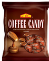
Q. Coffee Candy