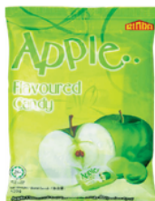
Q. Green Apple Flavoured Candy