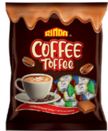
Coffee Flavoured Toffee