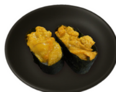
Frozen Sushi Squid Halal