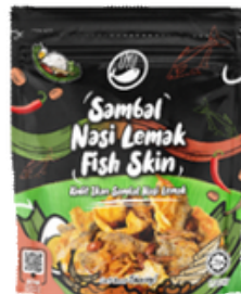
Oyu Sambal Nasi Lemak Fish Skin 30g