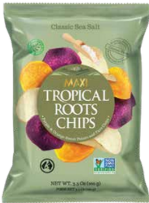
MAXI Tropical Roots Classic Sea Salt Flavor

Adhering to their philosophy to provide Better alternatives, Maxi Snacks' goods feature an innovative, ready-to-eat product line. Snack on delicious, gluten-free snack pellets made from traditional roots snacks from West Java-Indonesia with unique Indonesian spices, ready to eat crackers processed from the raw pellets, and high quality sliced, fried chips.