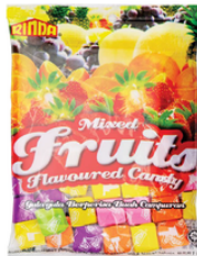
Square Mixed Fruits Flavoured Candy