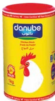
Chicken Boullion Powder 1kg

With assurance in delivering authentic flavor profiles that elevate home-cooked meals, Danube features four distinctive flavors of versatile food flavoring—Chicken Stock, Flavored Beef Stock, Flavored Lamb Stock, and Vegetable Stock, Danube that cater to diverse culinary preferences where each product is crafted to enhance the flavor of dishes while being rich in Vitamin A to promote nutritional benefits alongside taste.