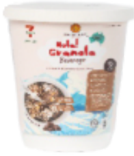
Hola! Granola Beverage Cup - Cocoa