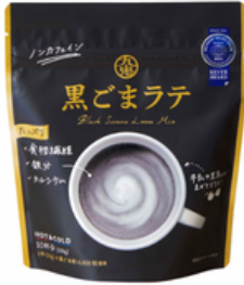
KUKI BLACK SESAME LATEE MIX(SWEETENED)-150g

Established in 1886, KUKI SANGYO CO., LTD. is a pioneer in sesame seed processing and a trusted manufacturer of halal-certified sesame-based products, seasonings, condiments, cooking oils, coffee, teas, and cocoa. Based in Japan, we combine traditional expertise with advanced food safety systems to deliver authentic Japanese flavors to global halal markets.