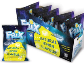
FRIX Lemon Mint Flavored Candy with Vitamin C