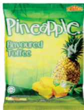
Pineapple Flavoured Toffee