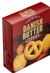
Everdelicious Danish Butter Cookies