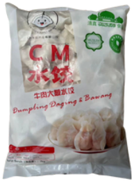
CM Dumpling - Beef & Scallion - 2kg