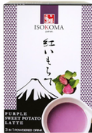
Purple Sweet Potato Latte