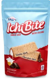
IchiBite Snack Bar With Vanilla Filling (pouch)