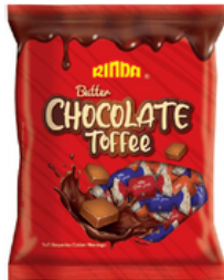
Butter Chocolate Flavoured Toffee