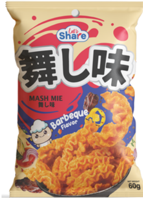
Mash Mie Barbeque Flavor