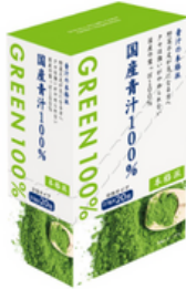
100% Japanese green juice (boxed)-50g

For everyone's health, beauty, and comfortable living environment, we cherish every encounter to share the new possibilities.