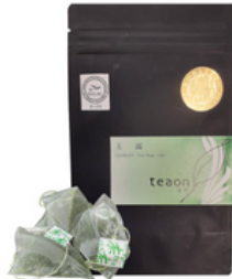
Gyokuro Tea Bag-30g