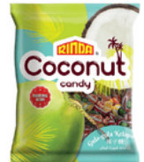
Traditional Coconut Candy