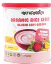
Natufoodies Organic Rice Cereal - Banana & Beetroot 200g