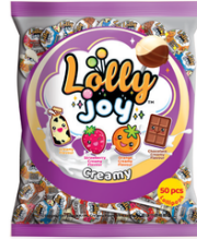
Lollyjoy Fruity Creamy Flavoured Lollipop