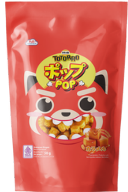
Totoro Pop - Caramel Flavor (pouch)