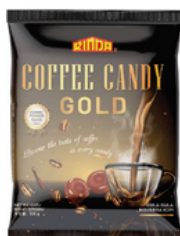
DEP. Coffee Candy GOLD