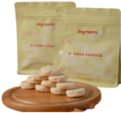
Traditional butter classic cookies