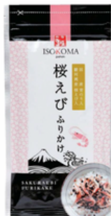
Sakuraebi (Shrimp) Furikake