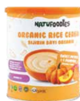
Natufoodies Organic Rice Cereal - Sweet Potato & Pumpkin 200g