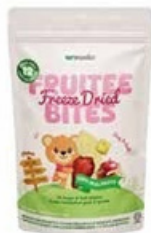
Natufoodies Freeze Dried Fruitee Bites - Apple Banana Strawberry 15G