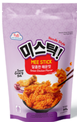
Mee Stick Noodle - Onion Chicken flavour (pouch)

Food With Benefits (FWB) is a brand renowned for its innovative fusion of global taste inspirations and authentic local culinary influences. Our product range includes unique offerings, such as sweet and spicy flavors that fuse the bold spices of Indonesian cuisine with modern snack formats from around the world.