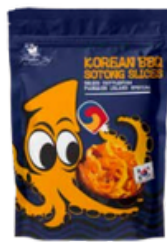
Pangkor Boy Korean BBQ Sotong Slice 50g