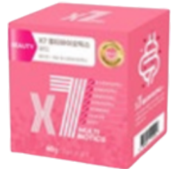
X7 Multibiotics Beauty