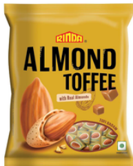
Square Almond Toffee