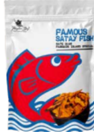
Pangkor Boy Satay Fish 50g