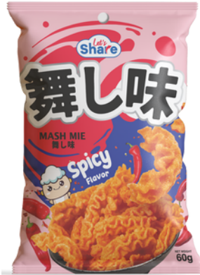
Mash Mie Spicy Flavor