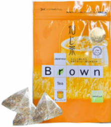
Hojicha Tea Bag-33g