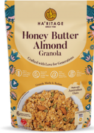
Honey Butte Almond Granola