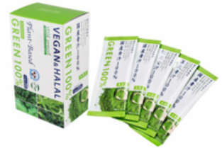
Japanese Aojiru 100%-20 sachets (boxed)