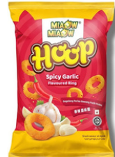
Miaow Miaow Hoop Spicy Garlic Ring