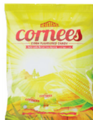
DEP. Cornees Flavoured Candy