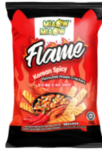
Miaow Miaow Flame Series Korean Spicy Prawn Cracker