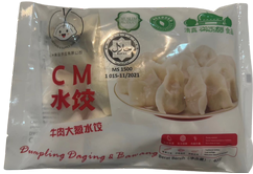
CM Dumpling - Beef & Scallion - 400g

We are committed to maintaining a balance between tradition and innovation, adhering to the principle of “integrity-based, quality first”, ensuring that every dumpling meets strict halal standards to meet the needs of consumers around the world.