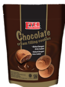
Everdelicious Chocolate Cream Filling Cookies