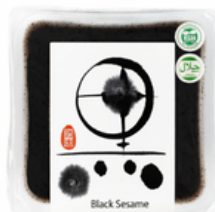
Black Sesame tofu