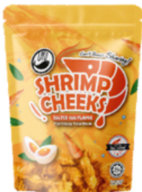
Oyu Salted Egg Shrimp Cheeks 30g