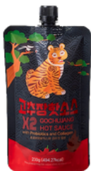
X2 Gochujang Hot Sauce

Shinsung Bio Pharm is engaged in the high value-added business of manufacturing collagen from discarded fish skin. As a company that cares about the environment, we are producing safer fish collagen, because of the concern that collagen from meat can pose risks to humans, such as mad cow disease, in the course of handling discarded by-products.