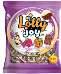
Lollyjoy Fruity Creamy Flavoured Lollipop