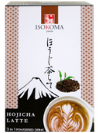
Hojicha Latte Box