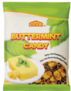
Buter Mint Flavoured Candy