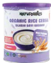
Natufoodies Organic Rice Cereal - Multigrain 200g