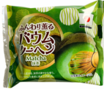
Softly scented Baumkuchen Matcha -55g