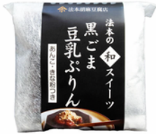
Soy milk Black Sesame pudding

Founded in 1952, Houmoto Sesame Tofu Shop Co., Ltd., based in Nagasaki, Japan, dedicated to craft authentic sesame tofu and peanut tofu using only natural ingredients. True to the Nagasaki-style tradition, the company carefully roasts sesame seeds in-house and grinds them with stone mortars, producing a uniquely rich aroma, nutty flavor, and smooth yet chewy texture.