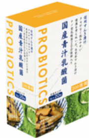
Japanese green juice soft (boxed)-60g