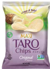
MAXI Cassava Crisps Classic Flavor