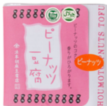
Chewy Peanuts tofu