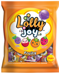
Lollyjoy Fruity Flavoured Lollipop

Rinda Food Industries Sdn. Bhd. was established in 1982. Since the beginning, our company's core competencies have been in confectionery manufacturing of candy, jelly and pudding. Through earnest dedication, passion and strategic marketing plans, we are now a successful international business entity with consistent market development worldwide. We are certified HALAL, ISO 22000 and HACCP. Food safety and quality are always our top priorities.