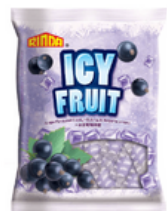
ICY FRUIT Grape Flavoured Candy