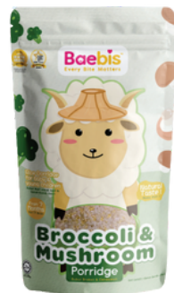
Broccoli & Mushroom Porridge