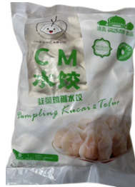
CM Dumpling - Chives & Eggs - 2kg