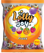
Lollyjoy Fruity Flavoured Lollipop