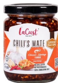
CHILI'S MATE CLASSIC SHRIMP FLAVOR