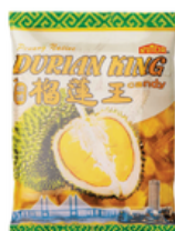
Q. Durian King Flavoured Candy