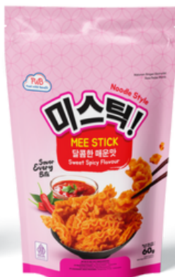
Mee Stick Noodle - Sweet Spicy flavour (pouch)