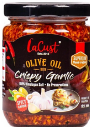
CHILI'S MATE CRISPY GARLIC WITH OLIVE OIL - SPICY GARLIC

Product Categories Halal Food Ingredients