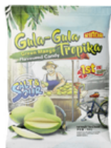
Tropika Salt & Sour Green Mango Flavoured Candy