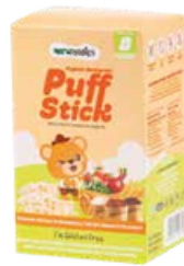
Natufoodies Organic Multigrain Puff Stick - Beetroot, Spinach & Strawberry 21g