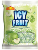
ICY FRUIT Apple Flavoured Candy