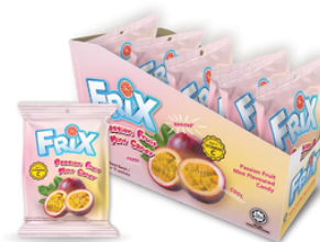
FRIX Passion Fruit Mint Flavored Candy with Vitamin C