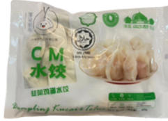
CM Dumpling - Chicken & Mushroom - 400g