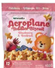
Natufoods Aeroplane Toddler Biscuit - Blueberry Beetroot 100g