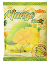
Q. Mango Flavoured Candy