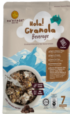
Hola! Granola Beverage - Cocoa