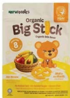
Natufoodies Organic Big Stick - Avo-Banana 20g