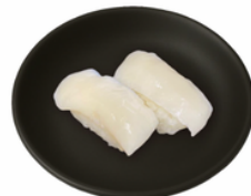
Frozen Sushi Squid Halal