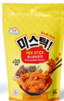
Mee Stick Noodle - Roasted Beef Flavour (pouch)