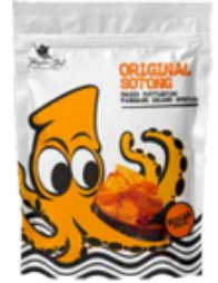
Pangkor Boy Original Sotong 50g