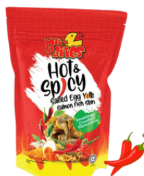
SALMON FISH SKIN-Hot spicy