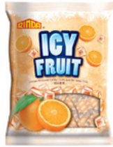
ICY FRUIT Orange Flavoured Candy