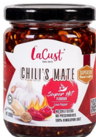
CHILI'S MATE SUPERHOT FLAVOR