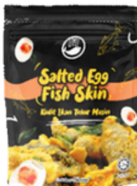
Oyu Salted Egg Fish Skin 30g