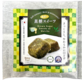
Brown Sugar Sweets of Matcha

Founded in 2011, J-avance Co., Ltd. is a Japanese company dedicated to introducing the unique culture and flavors of Japan to a global audience, with a special focus on Okinawan foodstuffs. Operating under the philosophy of "Hand to Heart," the company strives to convey a sense of genuine hospitality and sincerity through its products. They aim to not only share a taste of Japan but also to build lasting relationships with customers around the world.