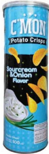
C'mon Potato Crisps Sour Cream & Onion