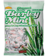
Barley Mint Flavoured Candy