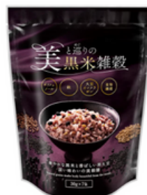
Black Mixed Grains for Beauty-210g