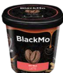
BlackMo Oat Milk Latte 340g