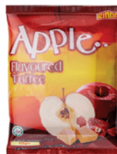
Red Apple Flavoured Toffee