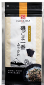
Gomanori (Sesame) Furikake

Founded in 1984, ISOKOMA Nori Co., Ltd. operates from Shizuoka City's historic Mariko district—once the twentieth post-town along the famed Tōkaidō highway. The company specializes in crafting premium Japanese culinary products, including roasted nori seaweed, flavorful furikake seasonings, and innovative instant latte mixes infused with traditional flavors.