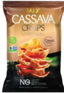
MAXI Cassava Crisps Classic Flavor