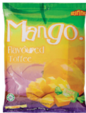
Mango Flavoured Toffee