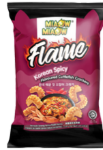
Miaow Miaow Flame Series Korean Spicy Cuttlefish Cracker