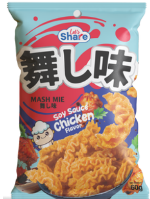
Mash Mie Soy Sauce Chicken Flavor