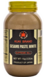
KUKI Pure Sesame Paste