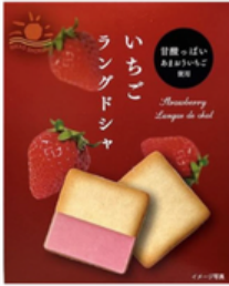
Langue de Chat (Stawberry)