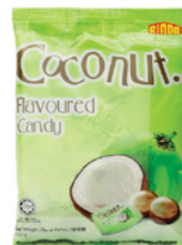
Q. Coconut Flavoured Candy