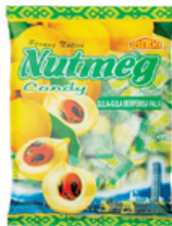
Q. Nutmeg Flavoured Candy