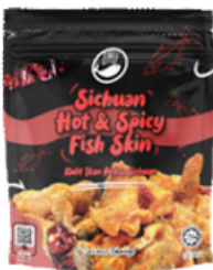
Oyu Sichuan Hot & Spicy Fish Skin 30g