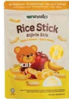
Natufoodies Rice Stick - Apple Banana 35g