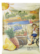
Tropika Salt & Sour Pineapple Flavoured Candy