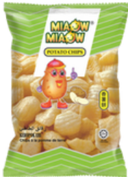
Miaow Miaow Potato Chips

Miaow Miaow brings you crunchy, flavorful snacks perfect for any craving! Sink your teeth into Potato Chips for a crispy classic or enjoy the bold taste of Pizza Flavoured Snacks. For seafood lovers, the Prawn Crackers deliver a savory bite, while the Chicken Flavoured Crackers are packed with rich, roasted flavor. Snack time just got more exciting with Miaow Miaow!