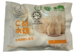
CM Dumpling - Lamb & Carrots - 400g