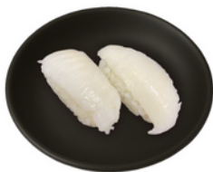
Frozen Sushi Flatfish Veranda (flounder fin) Halal