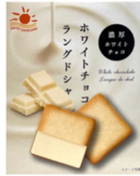
Langue de Chat (Whit chocolate)