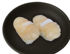
Frozen Sushi Scallop Halal