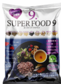
SUPER FOOD 9-120g