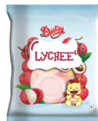
Darling Lychee Flavoured Pudding