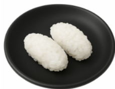
Frozen Sushi Rice Halal (Vinegared rice)

JS Food Co., Ltd. is a Tokyo-based manufacturer of Japan-quality frozen sushi. Working with veteran sushi artisans and rapid-freezing technology, JS Food develops sushi that can be naturally thawed at room temperature while preserving just-made texture and flavor.