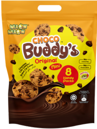
Miaow Biscuit Original Choco