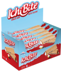
IchiBite Snack Bar With Vanilla Filling (box)