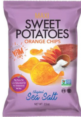
MAXI Orange sweet potato chips