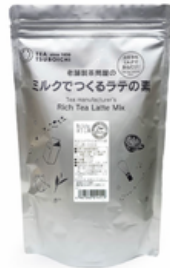
T2 Matcha Latte mix-1kg