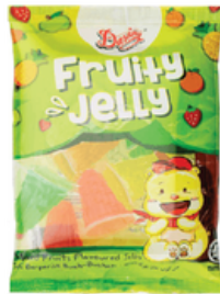
Darling Mixed Fruits Flavoured Jelly