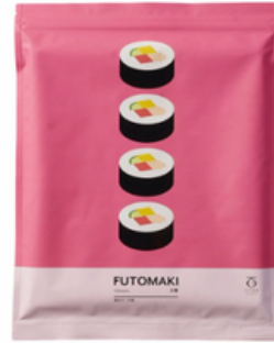
FUTOMAKI Roasted Seaweed (10 sheets)