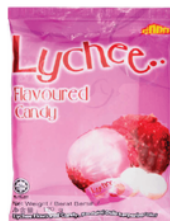
Q. Lychee Flavoured Candy