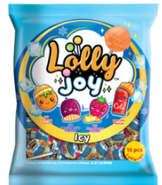
Lollyjoy ICY Flavoured Lollipop