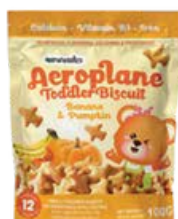
Natufoods Aeroplane Toddler Biscuit - Banana & Pumpkin 100g