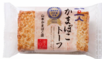
Bean Curd Texture Fish Cake - 190g (1 pcs)