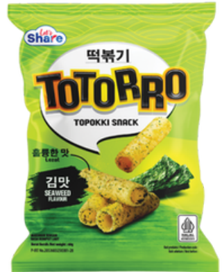
Totorro Snack Seaweed Flavor