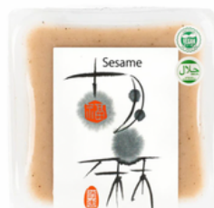
Sesame Tofu (sesame) No sauce Halal Vegan- 100g