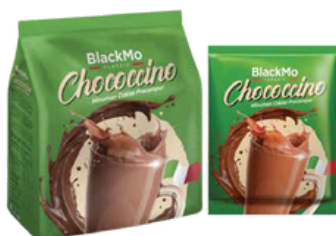
Blackmo Classic Premix Chococcino 540g