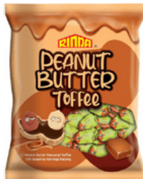
Peanut Butter Flavoured Toffee