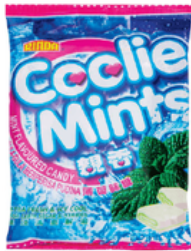
Coolie Mints Flavoured Toffee