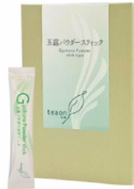
Gyokuro Powder Stick-15g