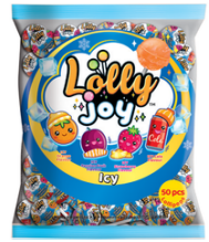
Lollyjoy ICY Flavoured Lollipop