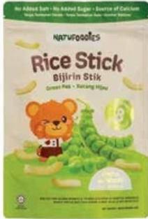
Natufoodies Rice Stick - Green Pea 35g

Let's Share, DagangHalal's innovative in-house brand, specializes in Korean fusion snacks that uniquely blend traditional Korean flavors with local influences. This exciting product line features goods like Sweet Balado-flavored snacks, which combine the rich, spicy essence of Indonesian cuisine with popular Korean snack formats.