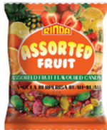
Assorted Fruits Flavoured Candy