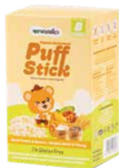
Natufoodies Organic Buckwheat Puff Stick - Sweet Potato & Banana 21g