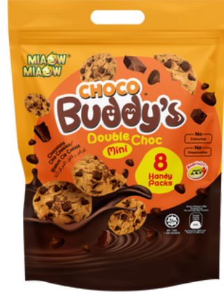
Miaow Biscuit Double Choco