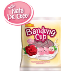
Rinda Lemonade Flavoured Pudding with Nata De Coco