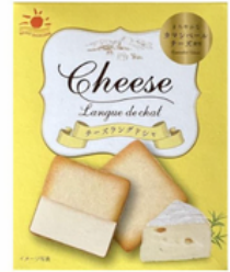
Langue de Chat (Cheese)