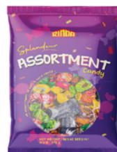
Splendeur Assortment Candy