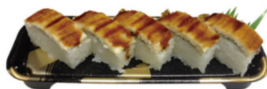
Ginger Syrup Kinkyokan -300ml