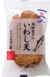
Tempura With Sardine - 138g (3 pcs)