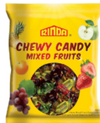
Chewy Mixed Fruits Flavoured Candy