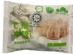
CM Dumpling - Chives & Eggs - 400g