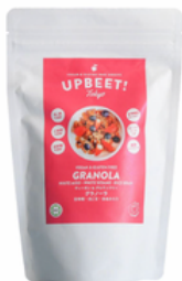
Plant-based & gluten-free Granola-180g