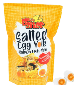
SALMON FISH SKIN-Salted egg yolk