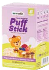
Natufoodies Organic Multigrain Puff Stick - Dragon Fruit & Blueberry 21g