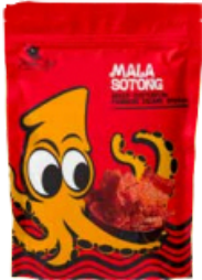
Pangkor Boy Mala Sotong 50g

We don't promise best price, but best quality from Pangkor's factory is assured.