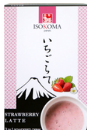
Strawberry Latte Box