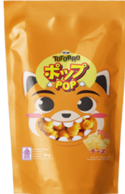
Totoro Pop - Cheese Flavor (pouch)