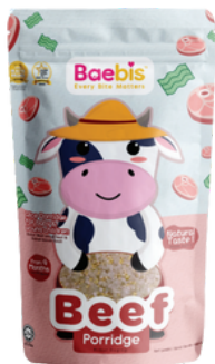
Beef & Seaweed Porridge

Baebis World is always researching the best foods to feed your babies at every meal. Quality nutrition should be accessible to everyone. Baebis World has created a comprehensive nutrition solution to give you the peace of mind you're feeding not just the best food, but the right food to your loved ones.